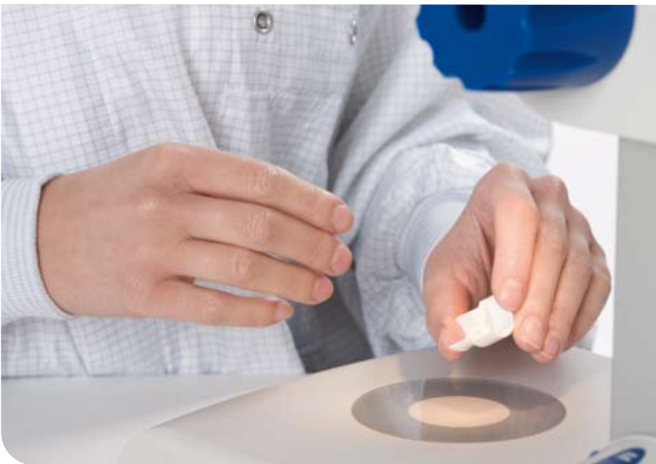
In-process checks, destructive test

Our die cast components are produced and assembled into finished units in cleanroom conditions according to ISO CLASS 7, going far beyond the requirements for the manufacturing for primary packaging. For Aero Pump, an approach based on customer standards simply goes without saying.