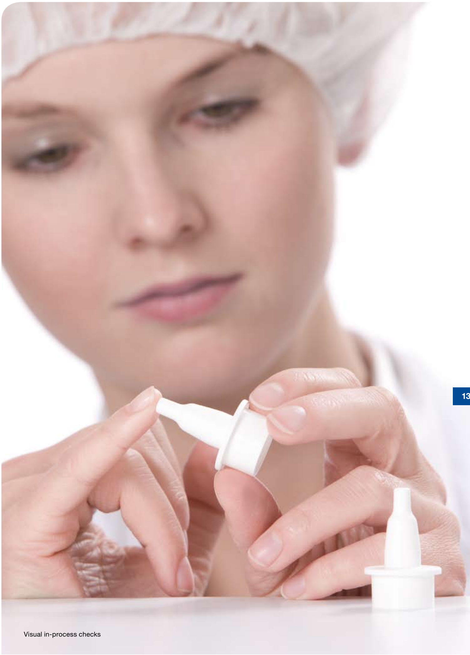
Visual in-process checks