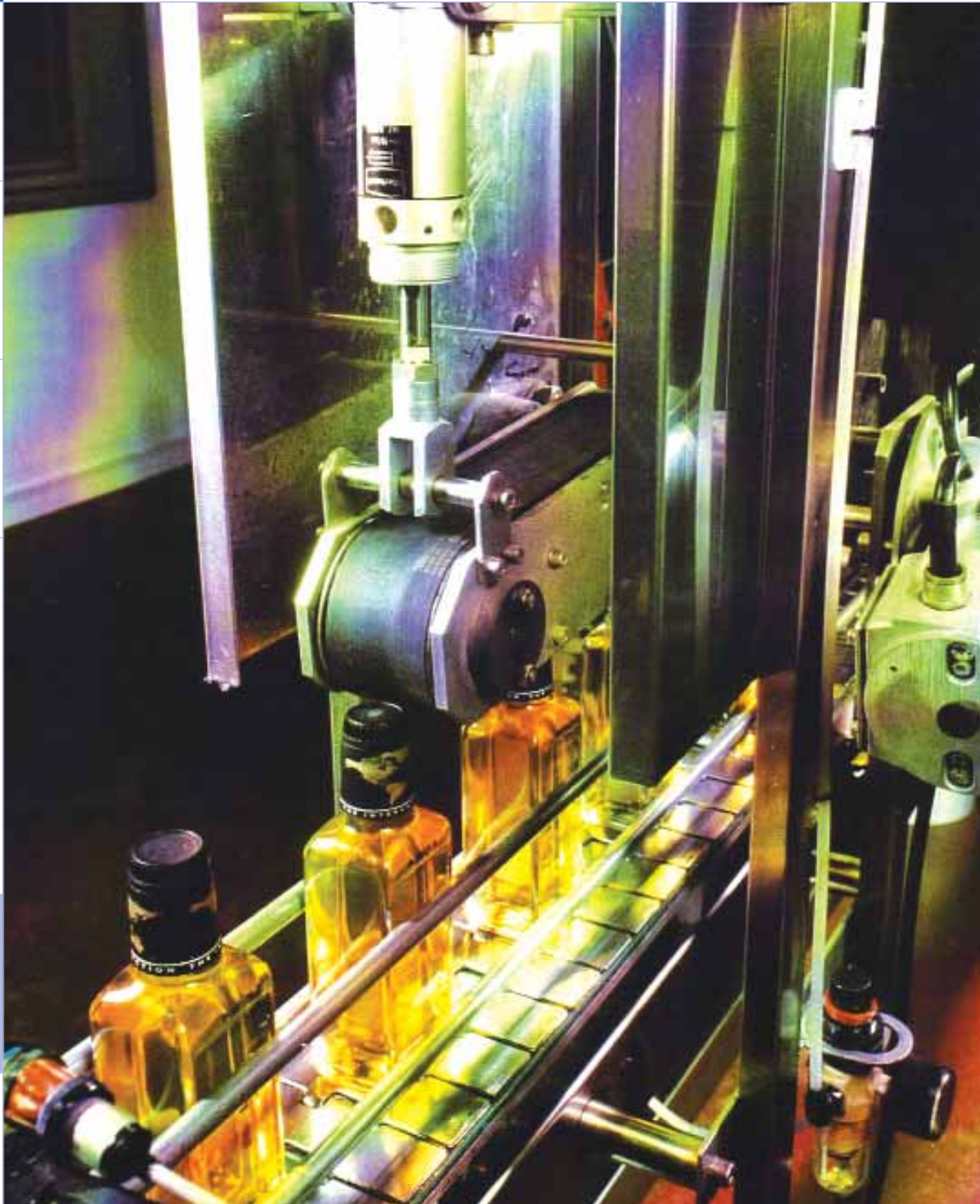
■ Lid Presser