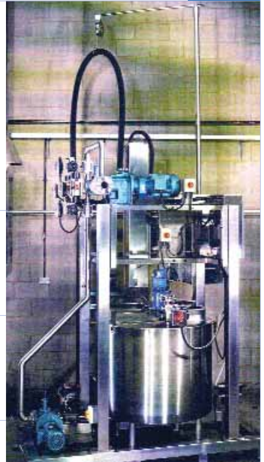
■ Drum Decanting Unit