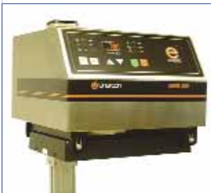
■ Enercon Induction Sealing