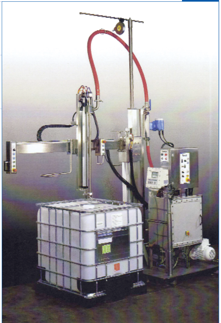
■ Atex Flowmeter Boom Filler illustrated