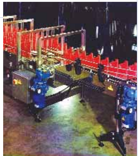
■ Inline Feed Table