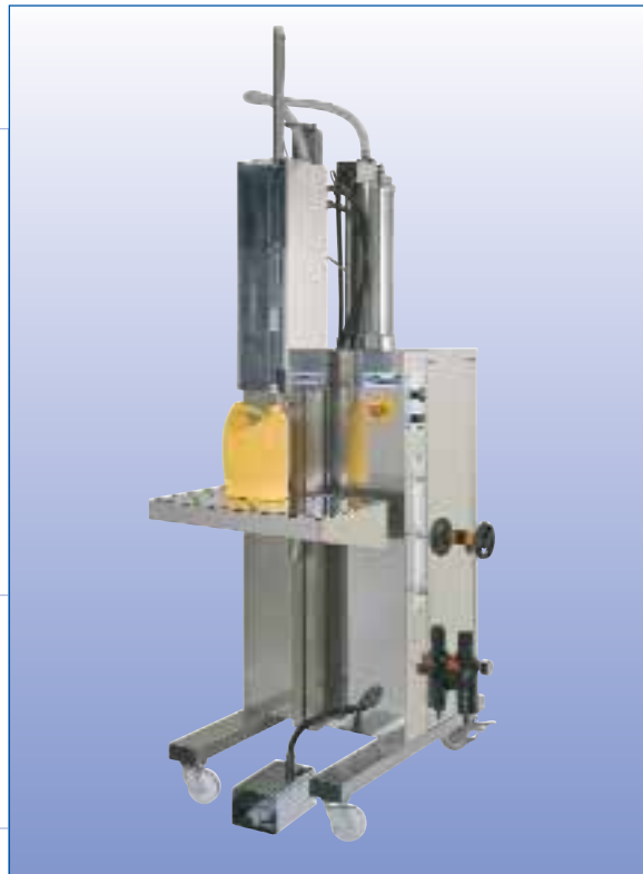
■ Semi-Automatic Volumetric 5 litre filler