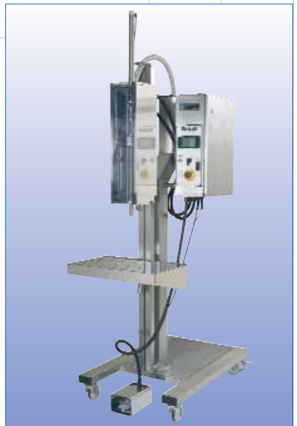
■ Semi-Automatic Flowmeter