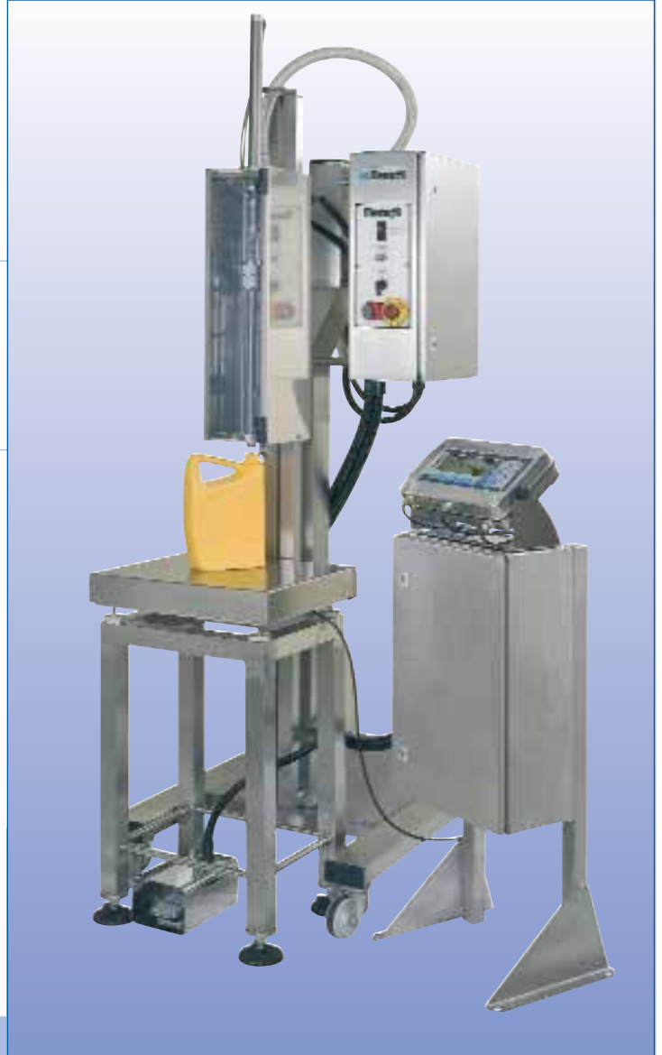
■ Semi-Automatic Weigh Scale Filler - Bench Height