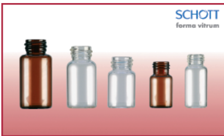
■ Tubular Type I glass diagnostic/screw neck vials

Vials can be manufactured to your precise specification for viable production runs.